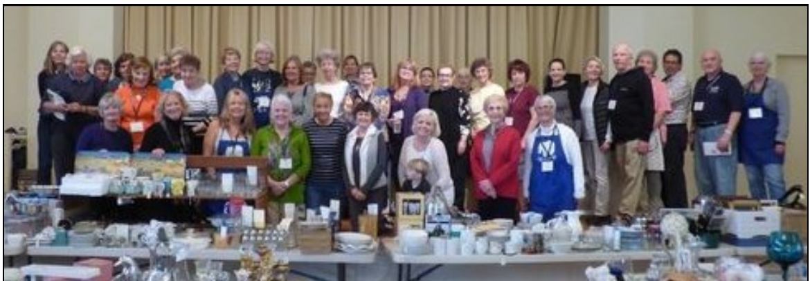
The Women of St. James and White Elephant volunteers