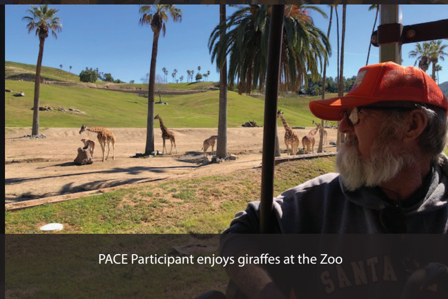
PACE Participant enjoys giraffes at the Zoo