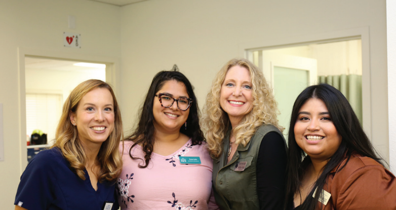
Industry partners support PACE North Re Opening