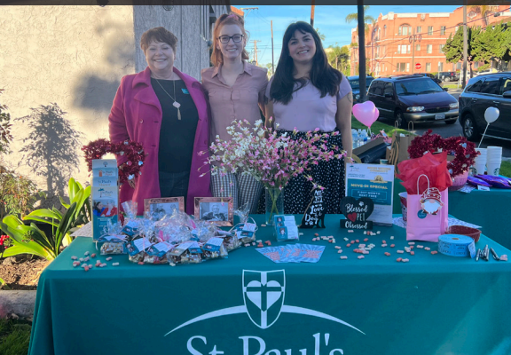
Marketing department hosts a Community Pup Event