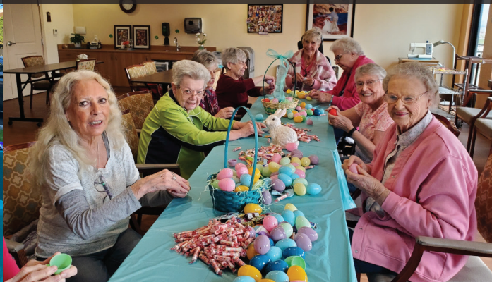
Plaza residents put together Easter eggs for St. Paul's Child Care program