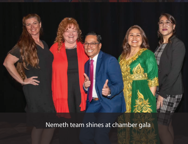
Nemeth team shines at chamber gala