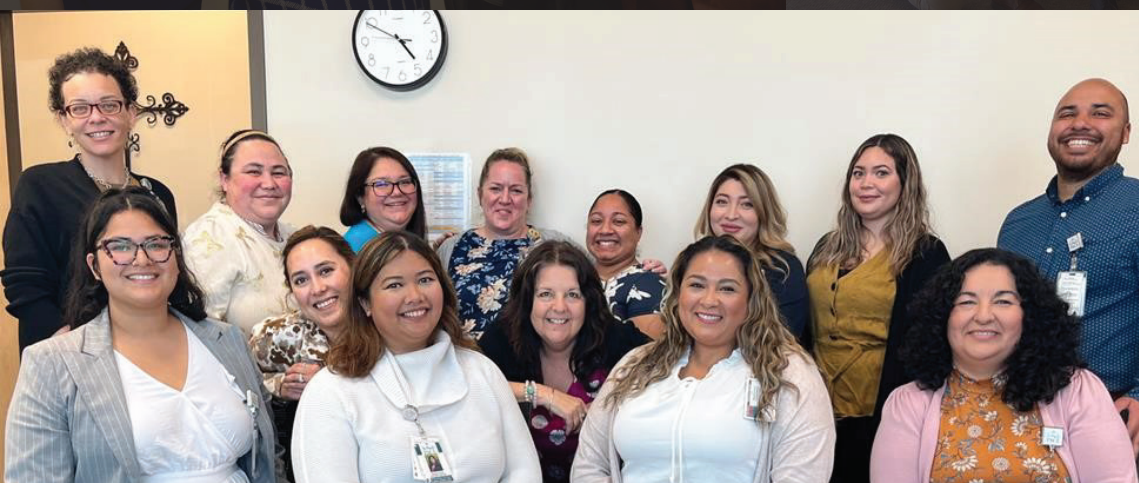
Enrollments organized pop up events at different sites