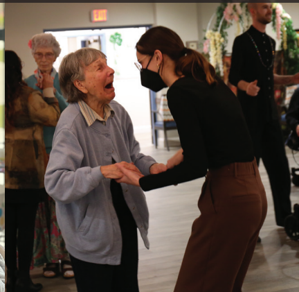
Villa resident and staff having a blast