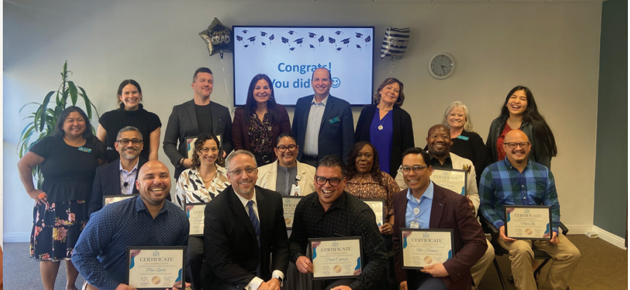
PACE leadership academy graduating class 2023