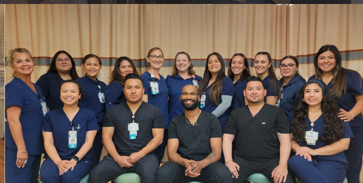
PACE's excellent nursing team