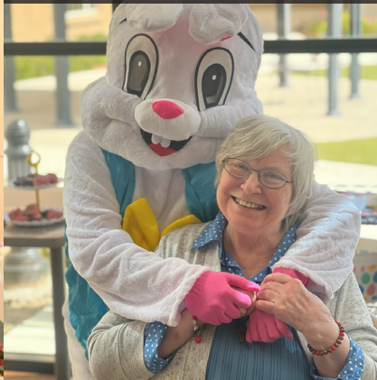
Plaza resident enjoys visit from Easter bunny