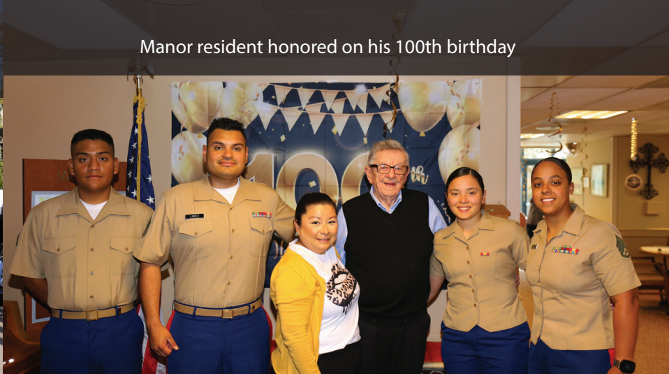
Manor resident honored on his 100th birthday