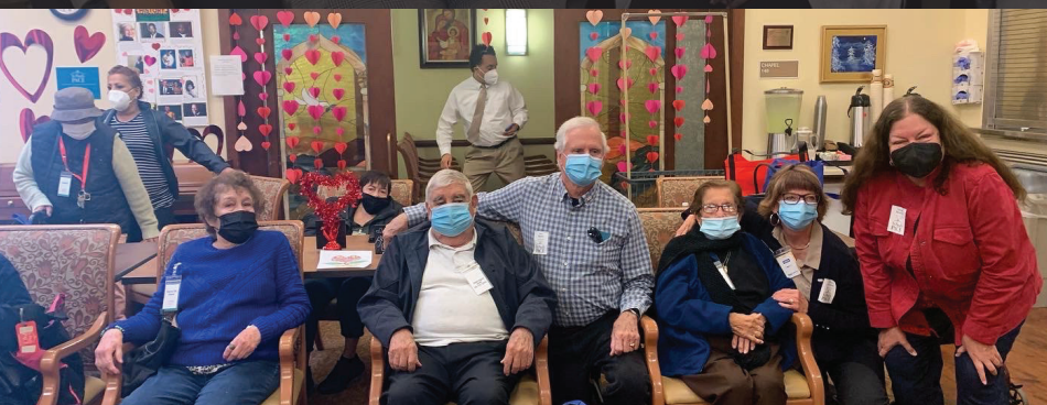
Chula Vista Rotary visit PACE participants with donations