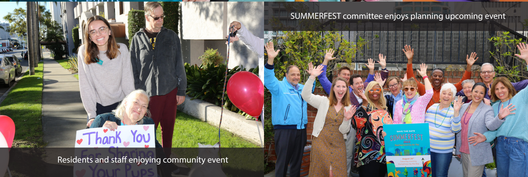
Residents and staff enjoying community event