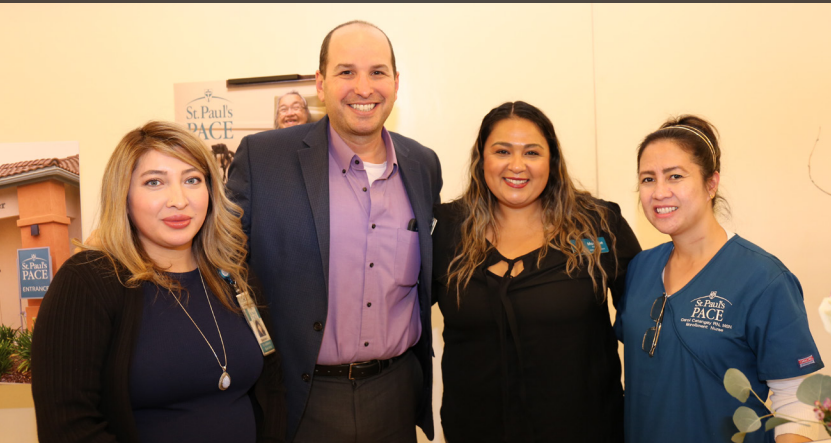
St. Paul's employees enjoying outreach event