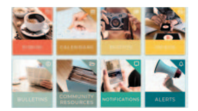
CONNECTED LIVING BY SENTRICS

St Paul's Senior Services has introduced a new technology access platform for residents, families and staff. Connected Living is a user-friendly web-based app to help residents stay connected to their community. Our residents will be able to find the latest updates on our calendars, easily sign up for activities and receive important community announcements from any device with internet access. Photos,