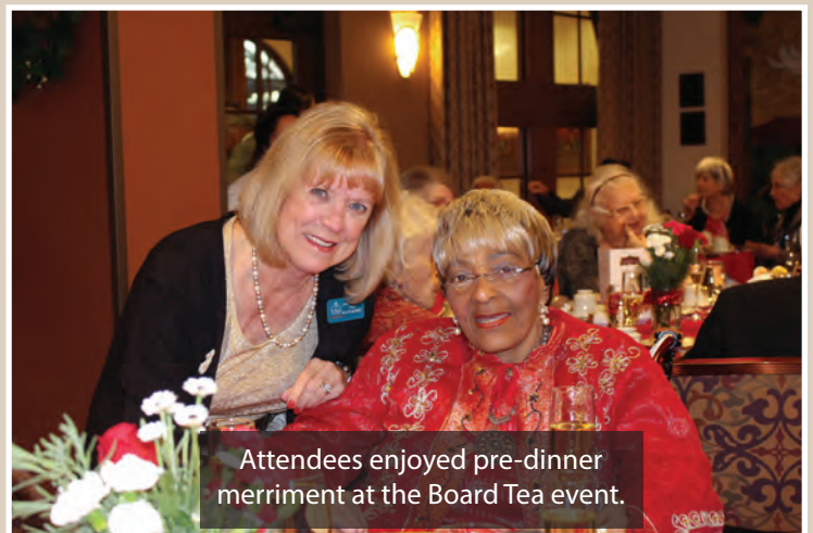
Attendees enjoyed pre-dinner merriment at the Board Tea event.

The annual Board Tea, hosted at St. Paul's Plaza, provided a fun-filled evening for St. Paul's Plaza, Manor, and Villa residents, and St. Paul's PACE participants. They enjoyed a delicious five-course meal carefully prepared by St. Paul's culinary masters and served with love by St. Paul's Senior Services Board members and employees. The feast was complete with holiday carols and dessert wine. The Board Tea is a yearly tradition that our seniors look forward to and an opportunity to delight in Christmas festivities.