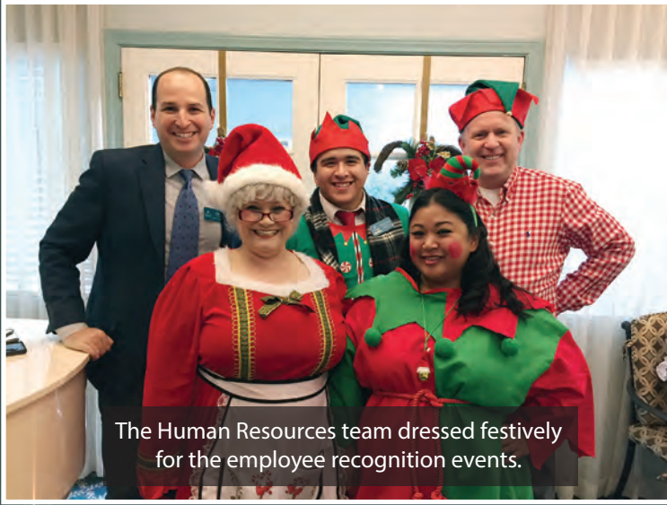
The Human Resources team dressed festively for the employee recognition events.