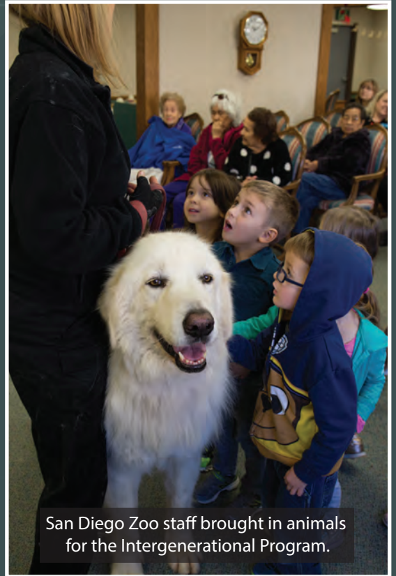
San Diego Zoo staff brought in animals for the Intergenerational Program.