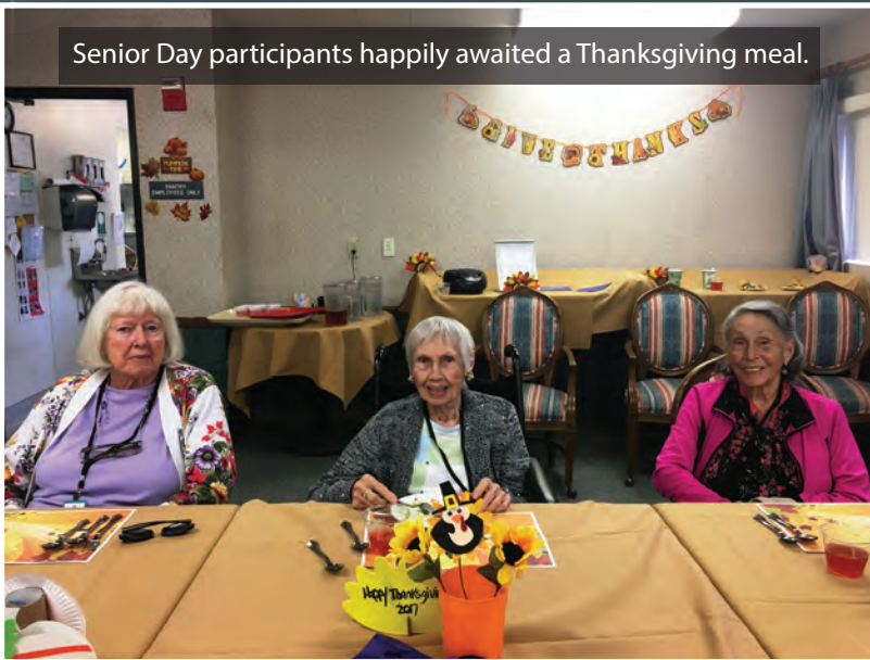
Senior Day participants happily awaited a Thanksgiving meal.