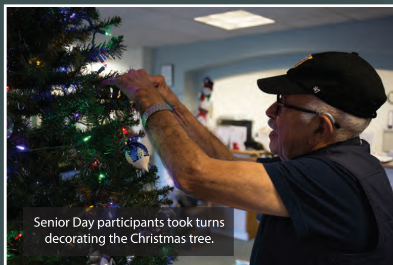
Senior Day participants took turns decorating the Christmas tree.