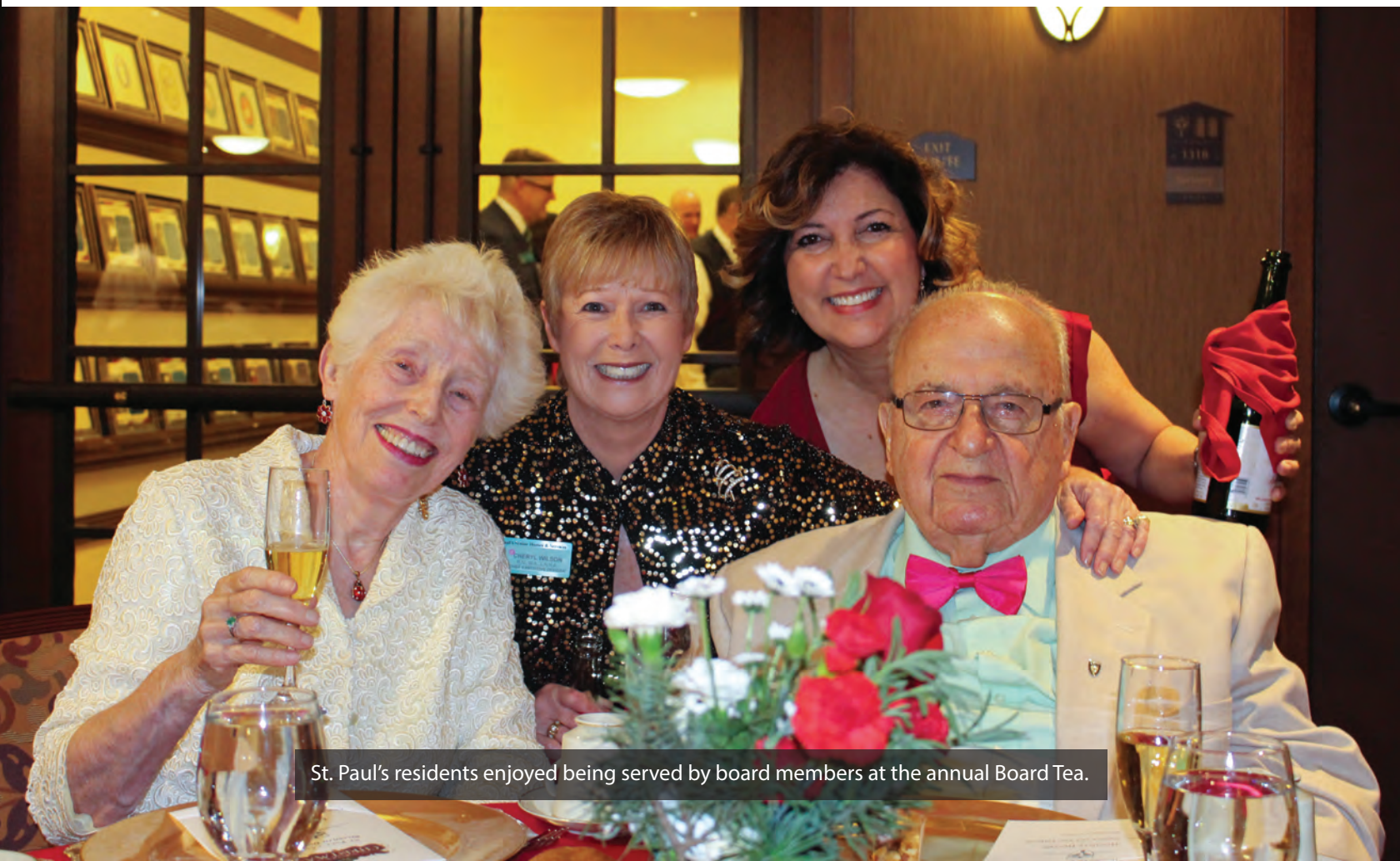
St. Paul's residents enjoyed being served by board members at the annual Board Tea.