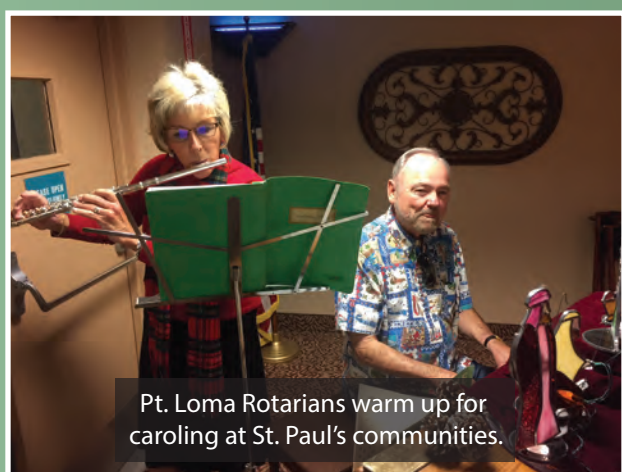
Pt. Loma Rotarians warm up for caroling at St. Paul's communities.