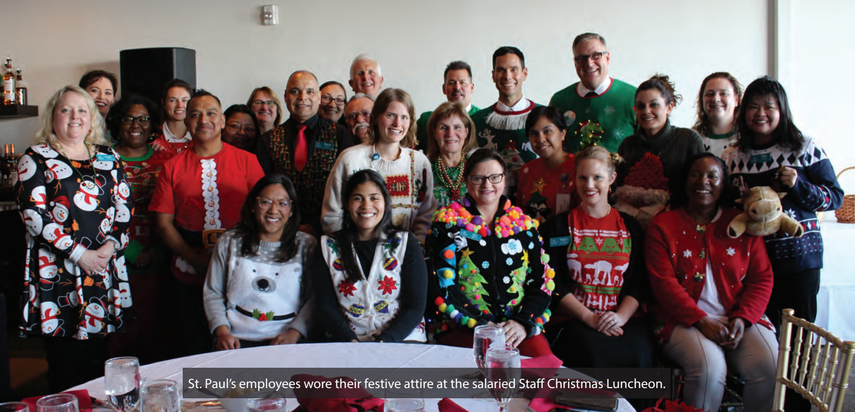
St. Paul's employees wore their festive attire at the salaried Staff Christmas Luncheon.