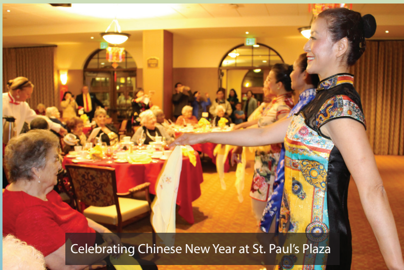
Celebrating Chinese New Year at St. Paul's Plaza