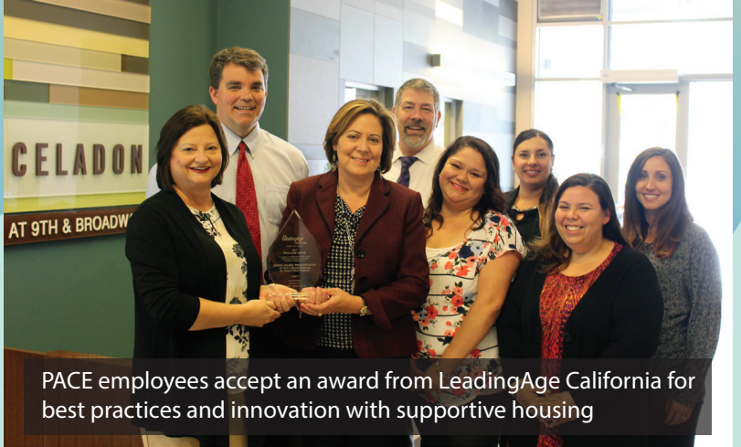
PACE employees accept an award from LeadingAge California for best practices and innovation with supportive housing