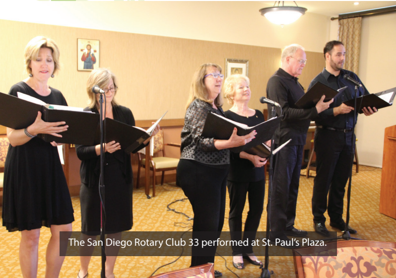
The San Diego Rotary Club 33 performed at St. Paul's Plaza.