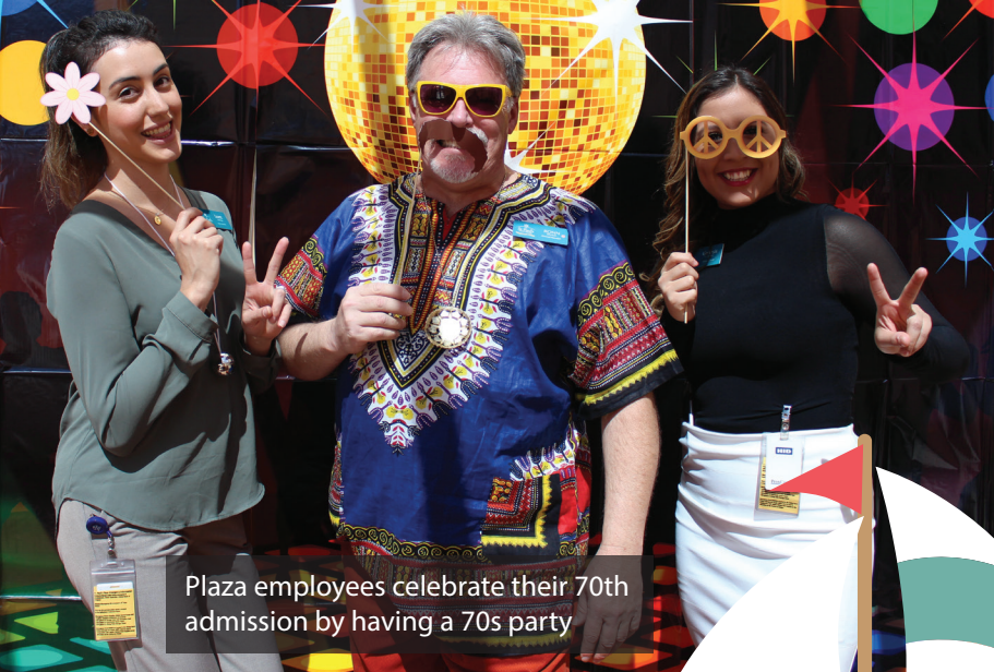
Plaza employees celebrate their 70th admission by having a 70s party