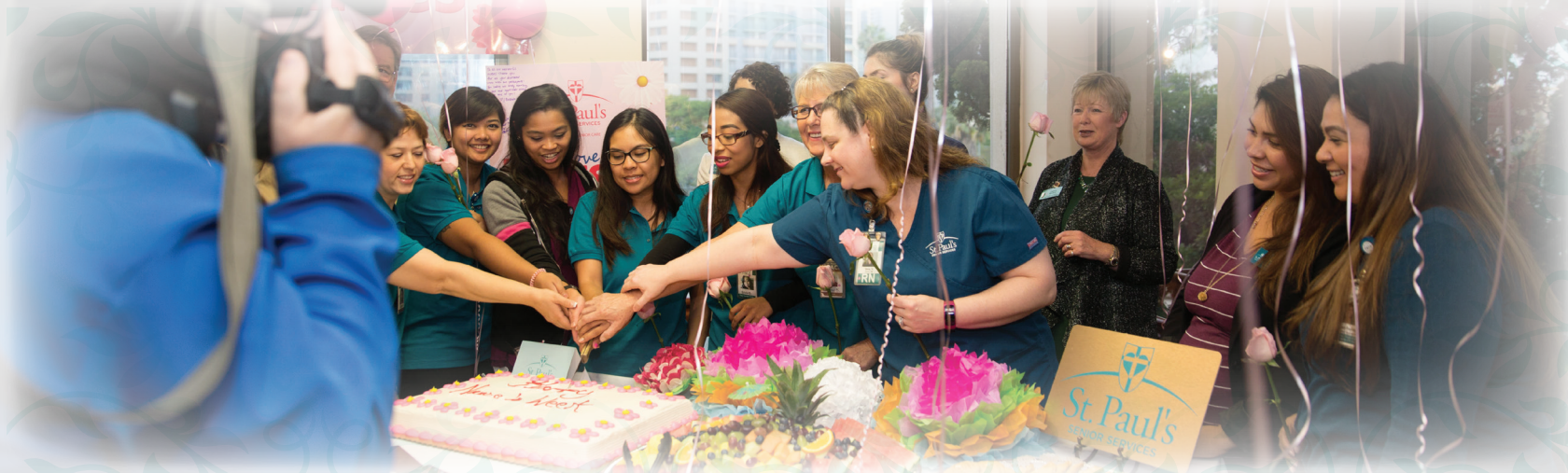
FOX5 celebrated Nurse's Day with our wonderful team at PACE Reasner.