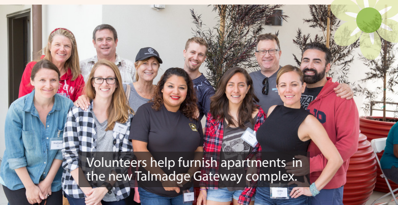
Volunteers help furnish apartments in the new Talmadge Gateway complex.

The new housing was designed by Studio E with affordable housing developers Wakeland. The project was conceptualized in spring of 2014 in collaboration with City Heights Community Development Corporation and in partnership with St. Paul's PACE program. Construction began in March 2016 and the vision came to fruition in May of 2017. It opened to residents early this summer.