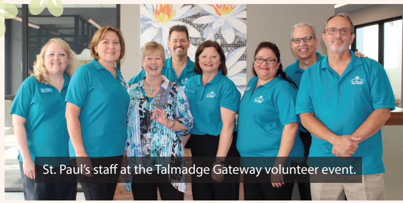
St. Paul's staff at the Talmadge Gateway volunteer event.