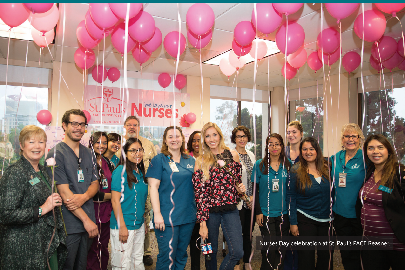
Nurses Day celebration at St. Paul's PACE Reasner.