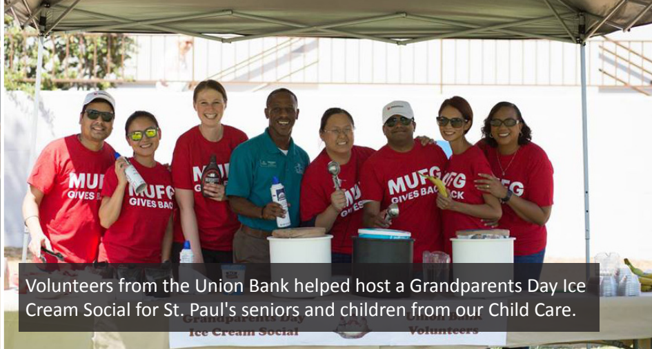
Volunteers from the Union Bank helped host a Grandparents Day Ice Cream Social for St. Paul's seniors and children from our Child Care.