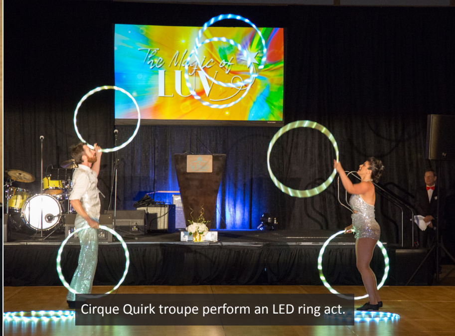
Cirque Quirk troupe perform an LED ring act.