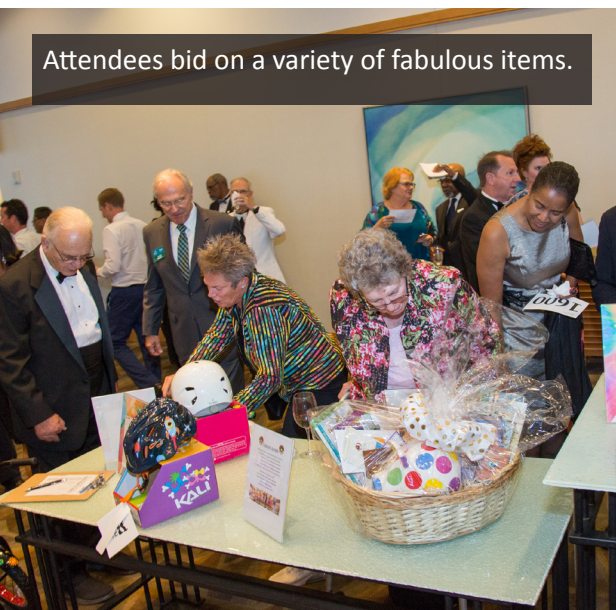
Attendees bid on a variety of fabulous items.

A special thank you to our friends at Flour Power Bakery in El Cajon who generously donated the desserts.