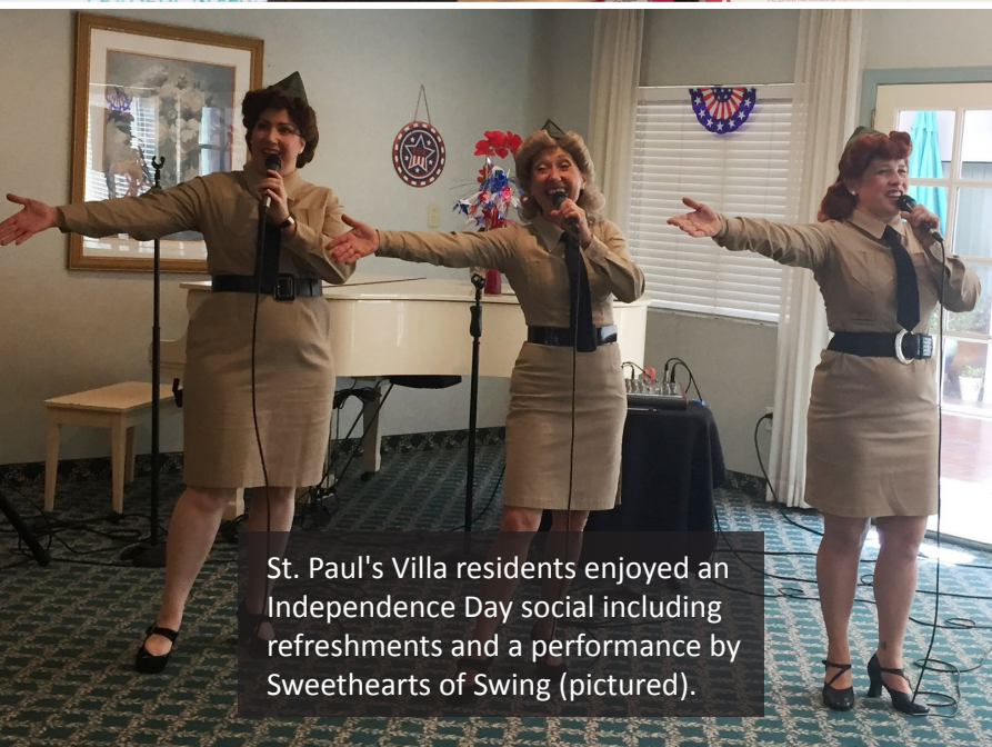
St. Paul's Villa residents enjoyed an Independence Day social including refreshments and a performance by Sweethearts of Swing (pictured).