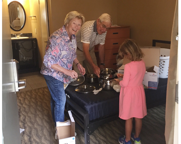
St. Paul's staff and volunteers from the Episcopal Church are all smiles after a day of setting up Park West apartments for formerly homeless St. Paul's PACE participants.