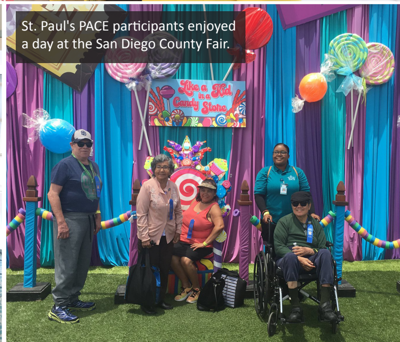
St. Paul's PACE participants enjoyed a day at the San Diego County Fair.