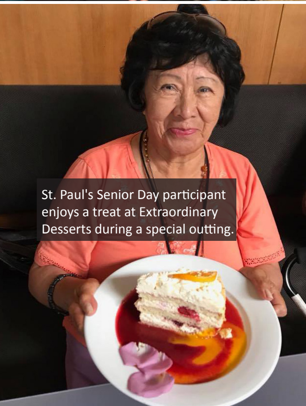
St. Paul's Senior Day participant enjoys a treat at Extraordinary Desserts during a special outing.