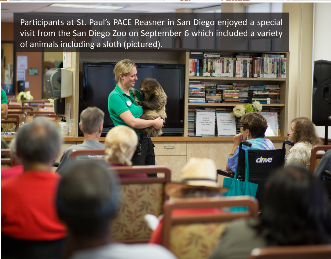
Participants at St. Paul's PACE Reasner in San Diego enjoyed a special visit from the San Diego Zoo on September 6 which included a variety of animals including a sloth (pictured).