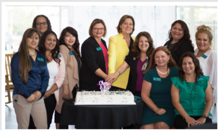
The St. Paul's PACE team gather around the 10-year celebratory cake.

St. Paul's Program of All-inclusive Care for the Elderly (PACE) celebrated 10 years of providing care for frail, low-income seniors enabling them to continue to live safely in the comfort of their own home. St. Paul's PACE staff and supporters of the program joined together to commemorate the milestone during a special event held on July 11 at the newest St. Paul's PACE center in El Cajon. The festivities included a special certificate presentation by a representative from the Mayor's office and a celebratory cake. The event and information about St. Paul's PACE was featured in The East County Californian on July 26, 2018.