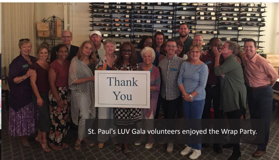
St. Paul's LUV Gala volunteers enjoyed the Wrap Party.