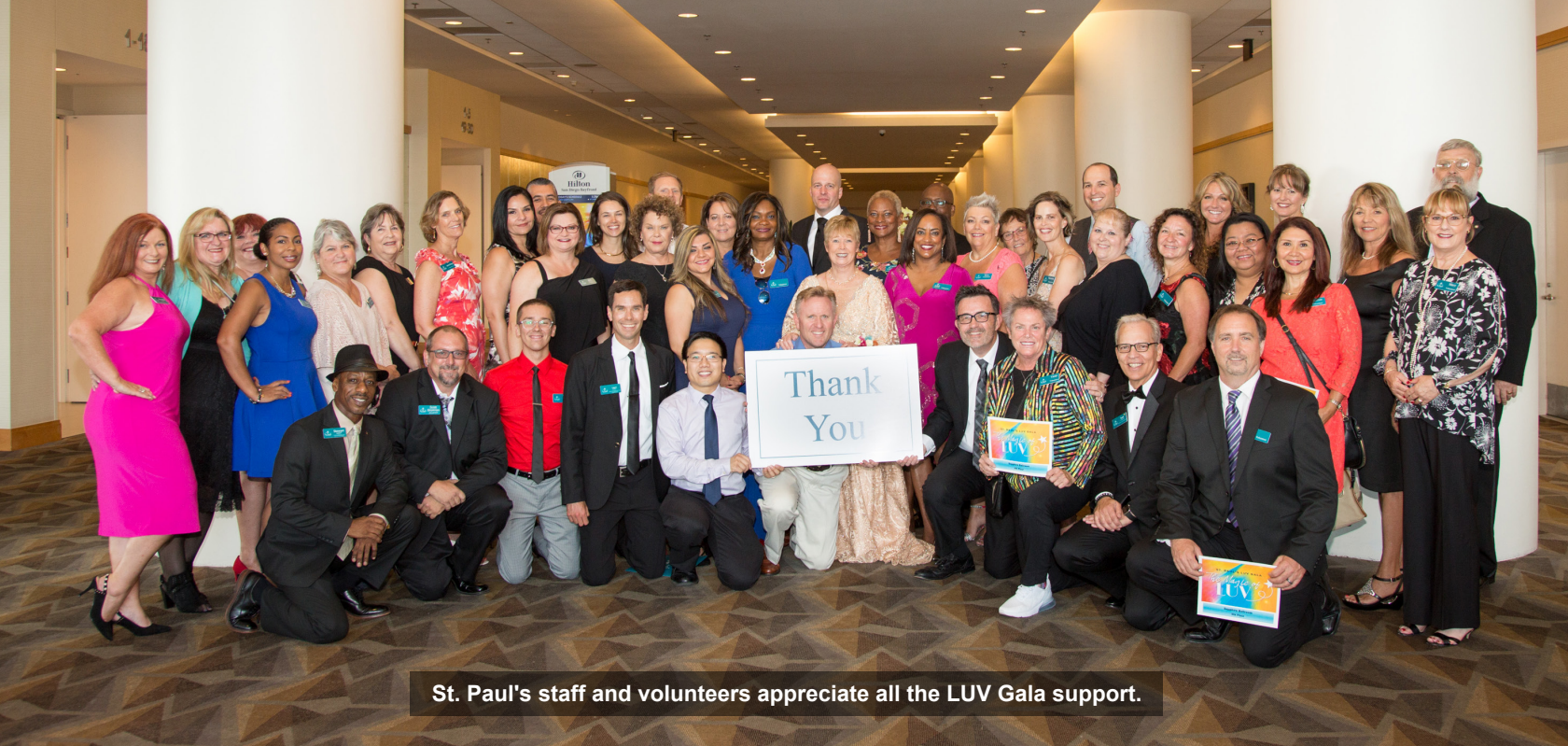
St. Paul's staff and volunteers appreciate all the LUV Gala support.