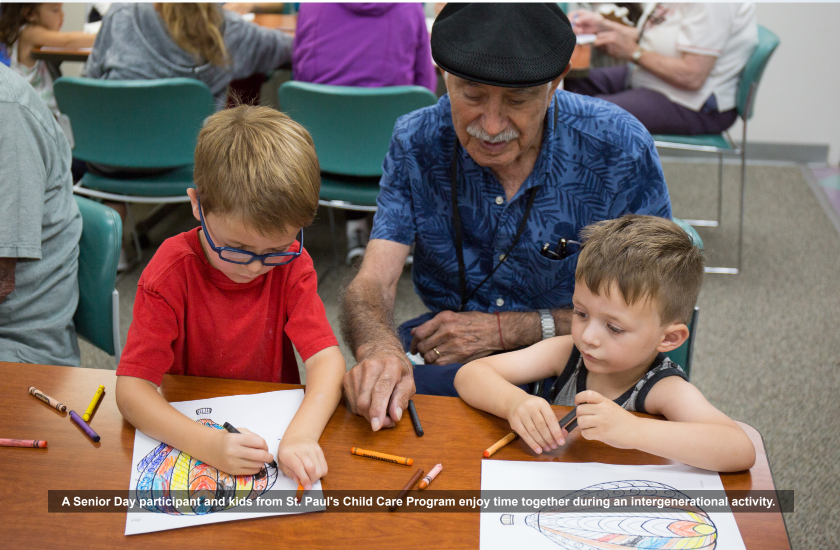
A Senior Day participant and kids from St. Paul's Child Care Program enjoy time together during an intergenerational activity.