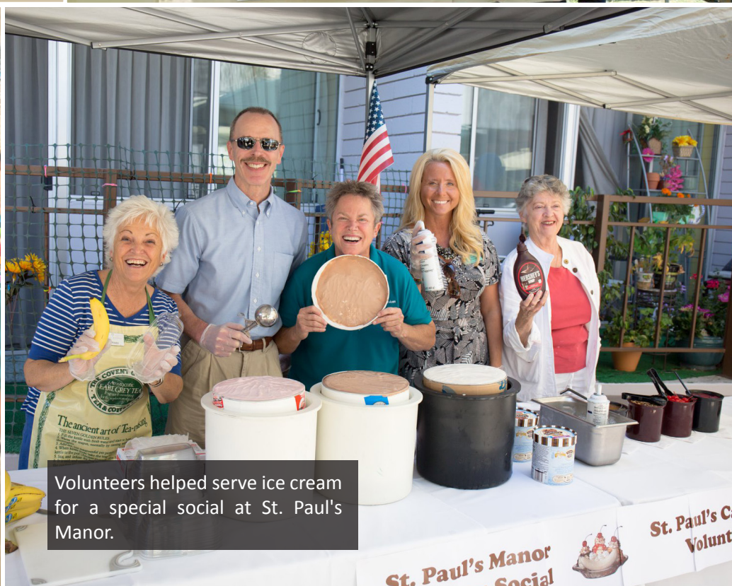
Volunteers helped serve ice cream for a special social at St. Paul's Manor.