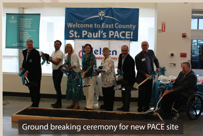
Ground breaking ceremony for new PACE site