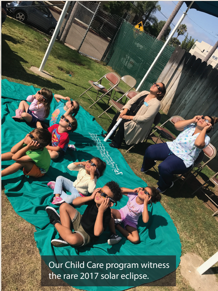
Our Child Care program witnesses the rare 2017 solar eclipse.