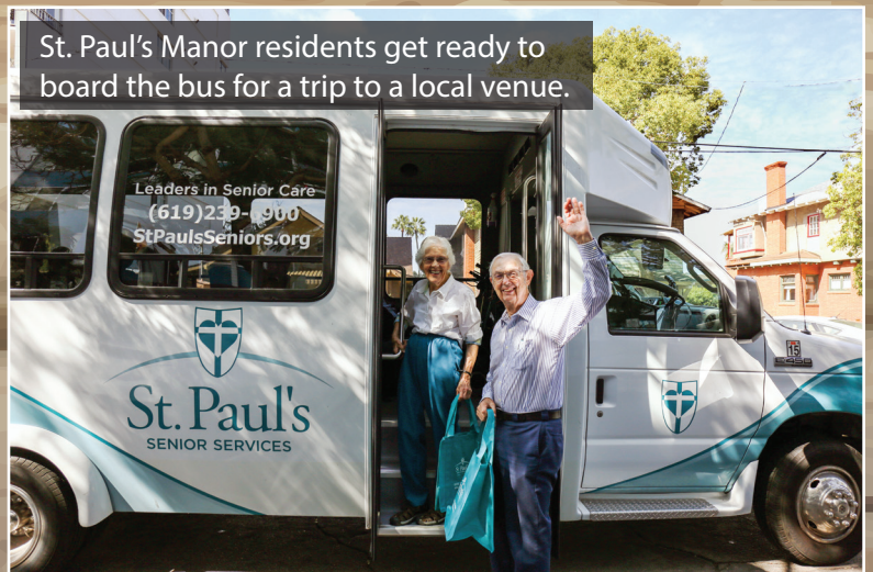
St. Paul's Manor residents get ready to board the bus for a trip to a local venue.