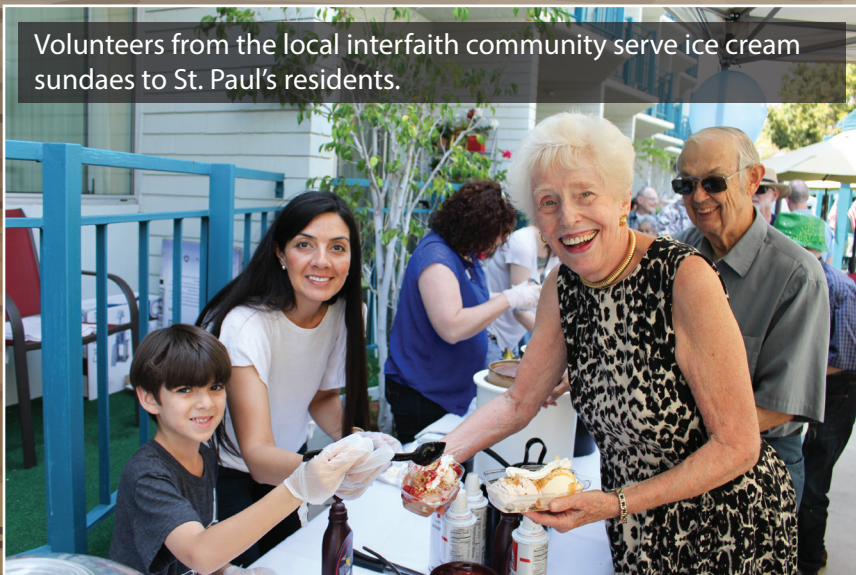
Volunteers from the local interfaith community serve ice cream sundaes to St. Paul's residents.