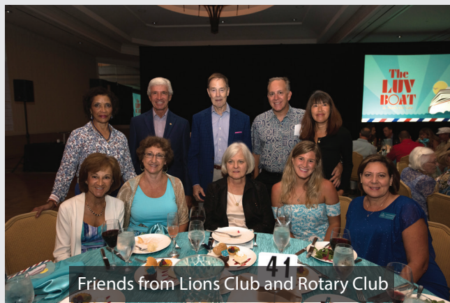
Friends from Lions Club and Rotary Club