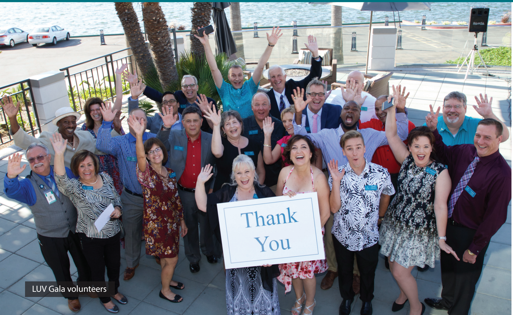
LUV Gala volunteers