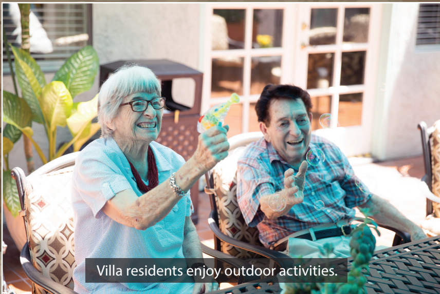
Villa residents enjoy outdoor activities.