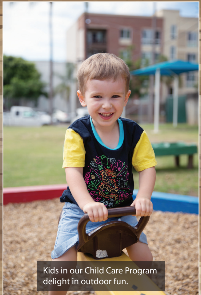
Kids in our Child Care Program delight in outdoor fun.