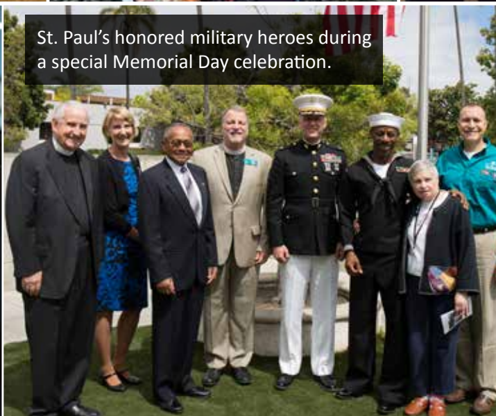
St. Paul's honored military heroes during a special Memorial Day celebration.