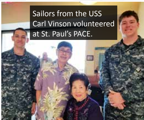
Sailors from the USS Carl Vinson volunteered at St. Paul's PACE.