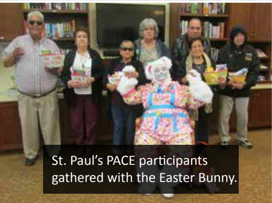
St. Paul's PACE participants gathered with the Easter Bunny.