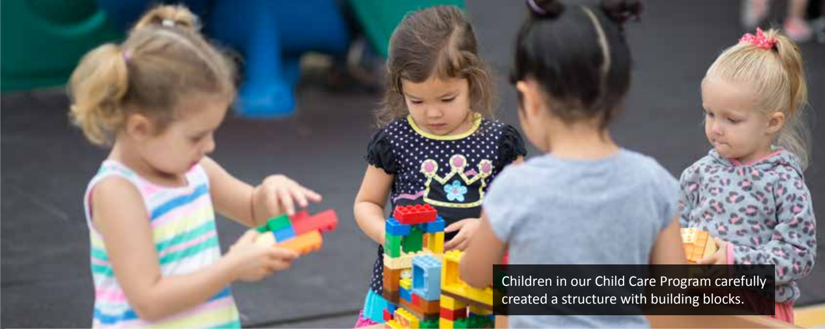
Children in our Child Care Program carefully created a structure with building blocks.