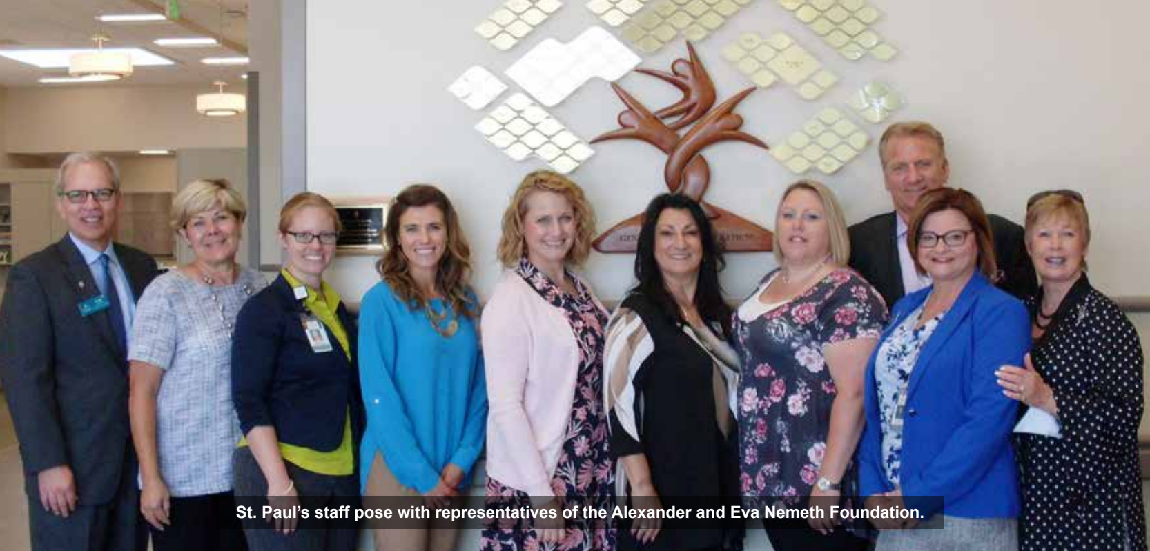
St. Paul's staff pose with representatives of the Alexander and Eva Nemeth Foundation.