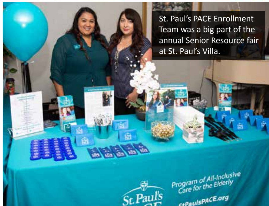
St. Paul's PACE Enrollment Team was a big part of the annual Senior Resource fair at St. Paul's Villa.