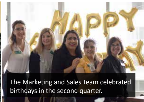
The Marketing and Sales Team celebrated birthdays in the second quarter.