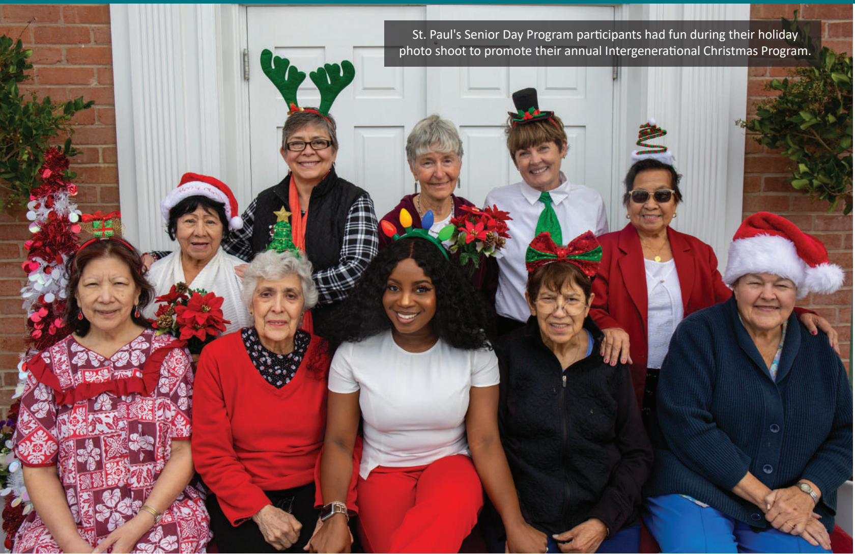
St. Paul's Senior Day Program participants had fun during their holiday photo shoot to promote their annual Intergenerational Christmas Program.