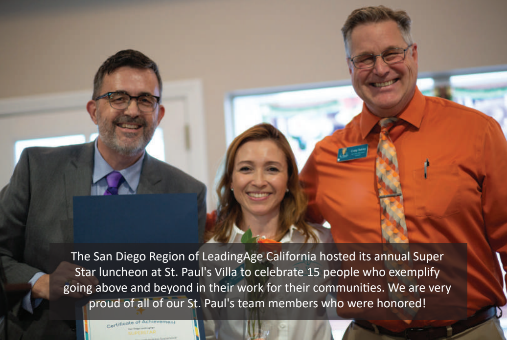
The San Diego Region of LeadingAge California hosted its annual Super Star luncheon at St. Paul's Villa to celebrate 15 people who exemplify going above and beyond in their work for their communities. We are very proud of all of our St. Paul's team members who were honored!