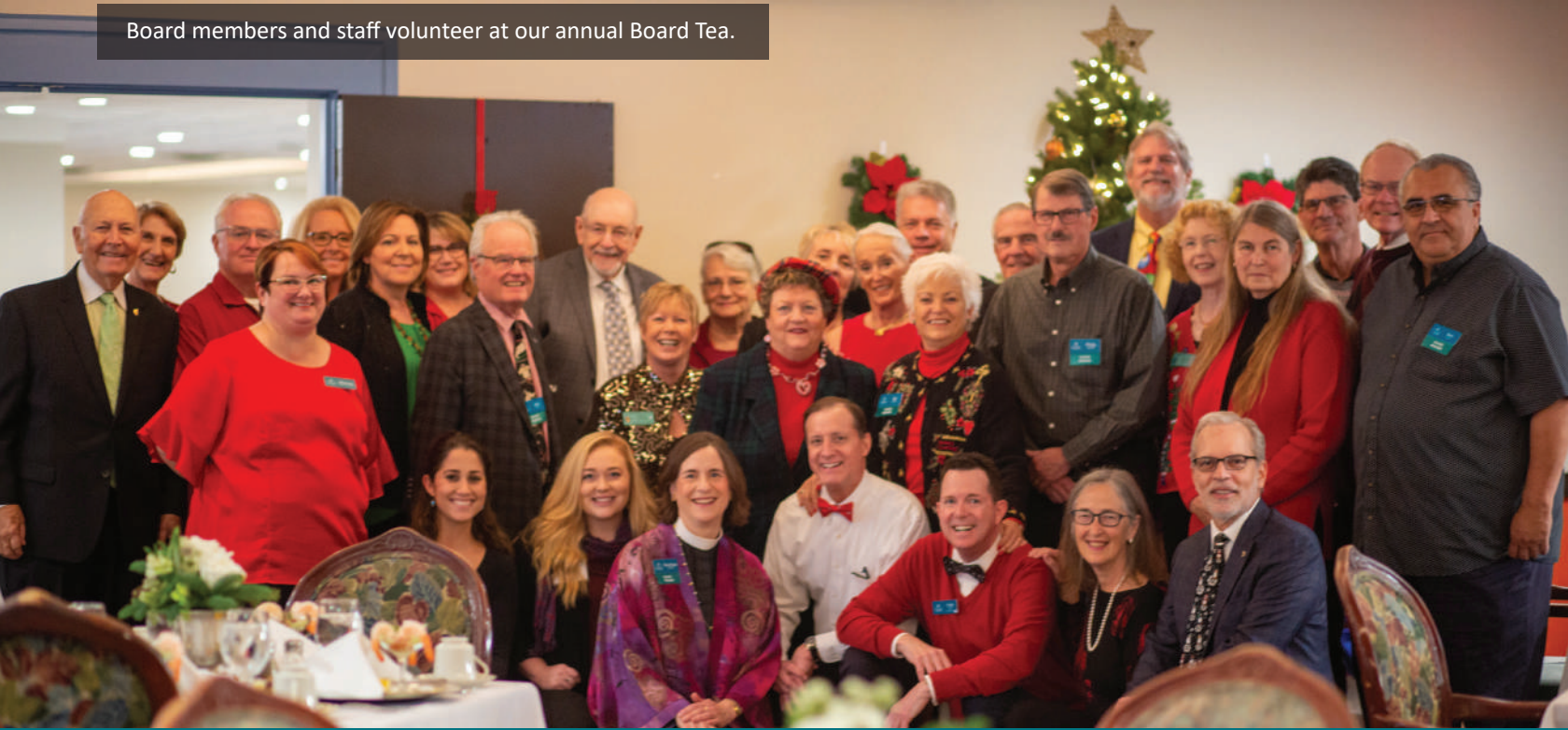
Board members and staff volunteer at our annual Board Tea.