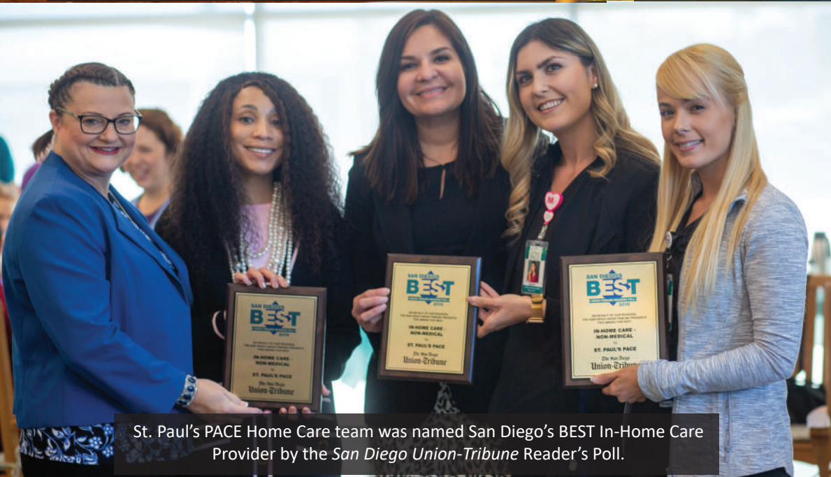
St. Paul's PACE Home Care team was named San Diego's BEST In-Home Care Provider by the San Diego Union-Tribune Reader's Poll.