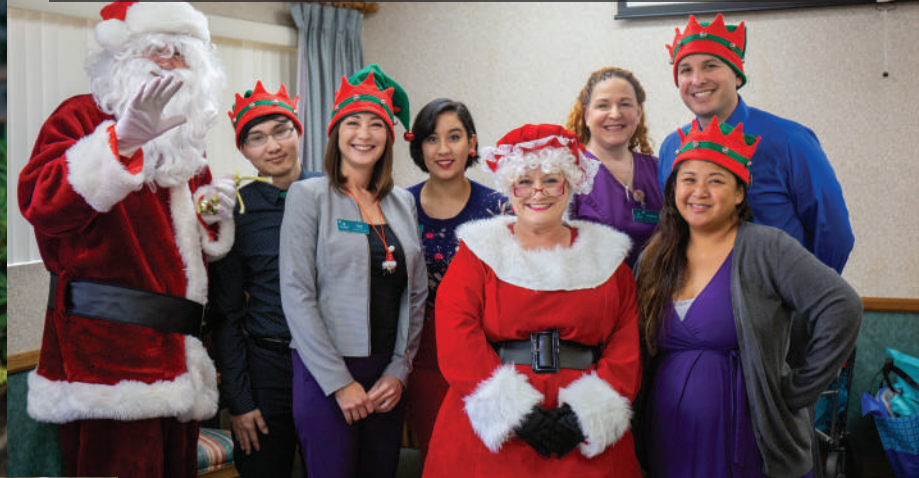
Our Human Resources team hosts Employee Appreciation Events to honor our staff each December. Hourly employees receive checks from the money collected through our Employee Appreciation Fund, and they recognize the accomplishments and anniversaries of our staff.