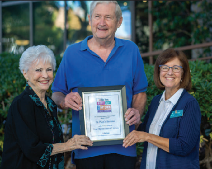
St. Paul's Manor was selected as the San Diego Uptown News GOLD Winner and the San Diego Downtown News!