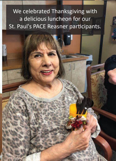
We celebrated Thanksgiving with a delicious luncheon for our St. Paul's PACE Reasner participants.