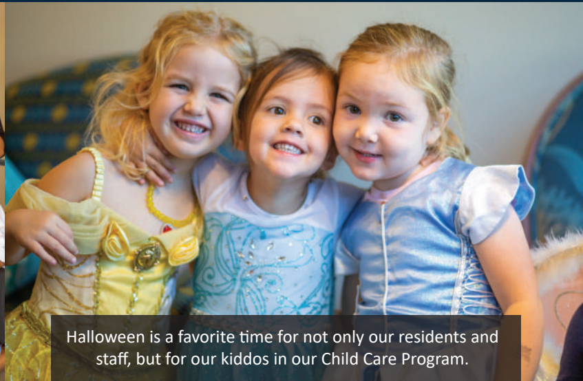
Halloween is a favorite time for not only our residents and staff, but for our kiddos in our Child Care Program.